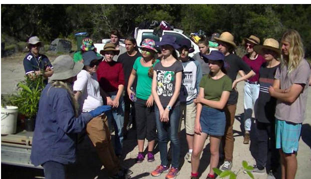
Students get the run down on the planting

Thanks to Tweed Landcare for the grant (through sponsorship from Stroud Homes Northern Rivers) and Mt St Patrick College teachers and students who came along and planted the trees.