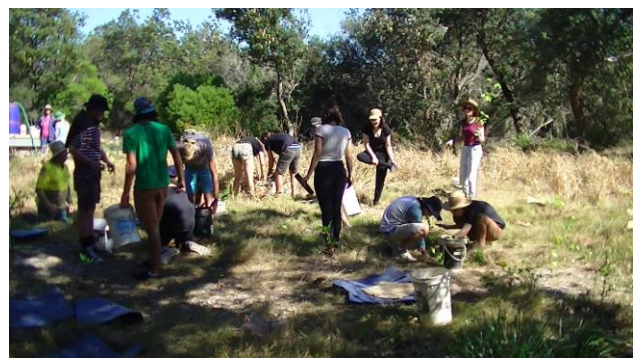
Students busy planting